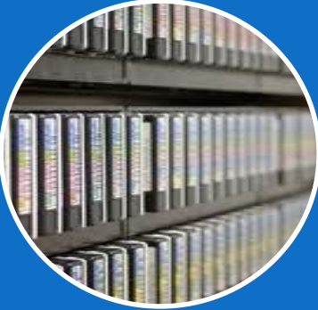
Data Tape storage media