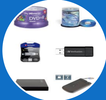
External back up Devices & Archive media