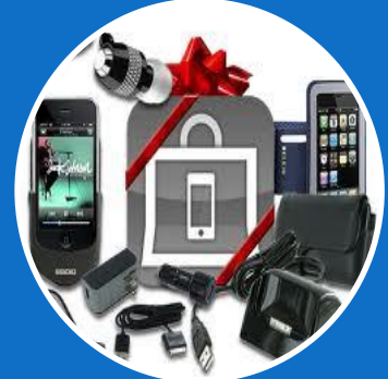
Peripherals, smart phone & tablet accessories